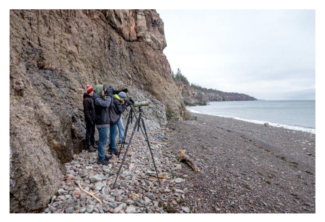
The Penner party at Kirk's Brook. just west of Morden. in Zone 2.